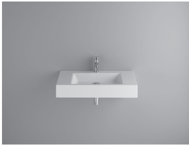
Design: schmidtem design